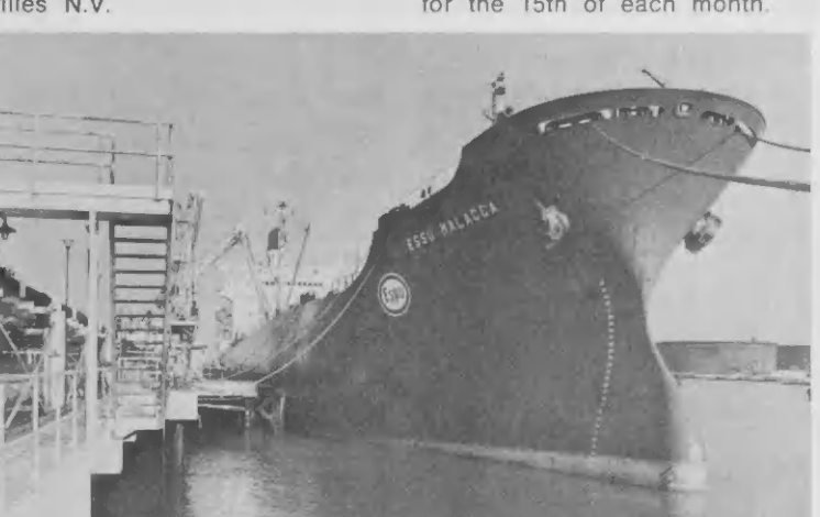
"Esso Malacca" on June 28 took the first cargo of 135,000 barrels of C450 low sulfur fuel oil processed by the new HDS units to West Palm Beach for discharging into Humble's tankage.

Forms for submitting slogans are available at all servica stations. Slogans, of not more than ten words, pertaining to traffic safety should be turned in befor the 15th of each month.